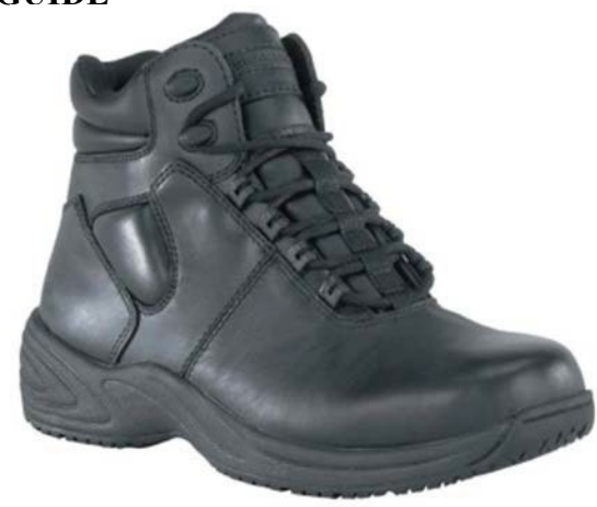
#6 is acceptable if heel height is not higher than 2 inches.