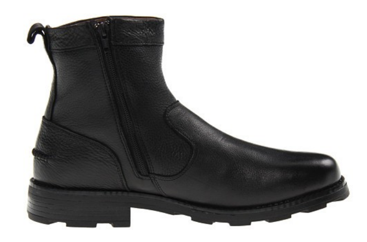
#40 is acceptable if heel height does not exceed 2" Not authorized for wear with shorts.