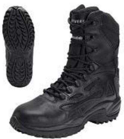
#8 is acceptable if writing is blacked-out or covered by trousers. Not authorized for wear with shorts.