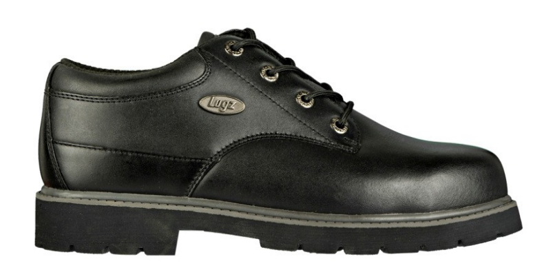
#11 is acceptable if logo is blacked-out.