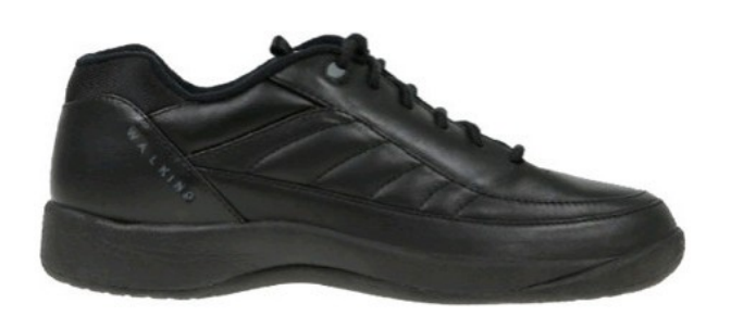
#21 is acceptable if writing is blacked-out