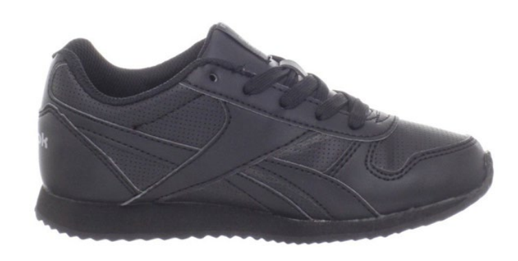
#20 is acceptable if writing is blacked-out

#18 is acceptable is writing is blacked-out.