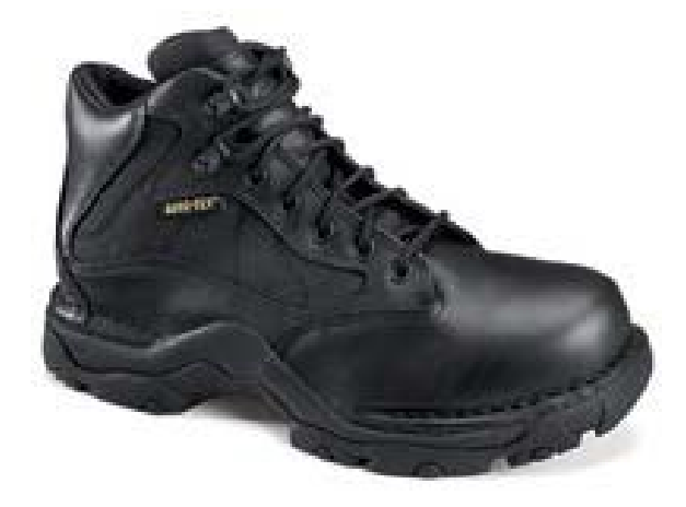
#5 is acceptable if lettering on label is blacked-out.