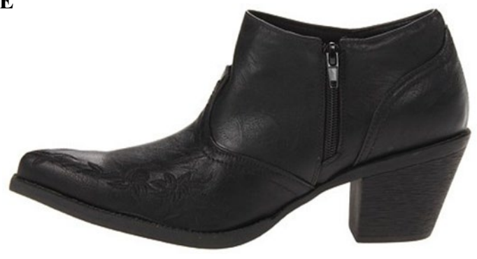
#22 is acceptable if the heel height does not exceed 2". Not authorized for wear with shorts.